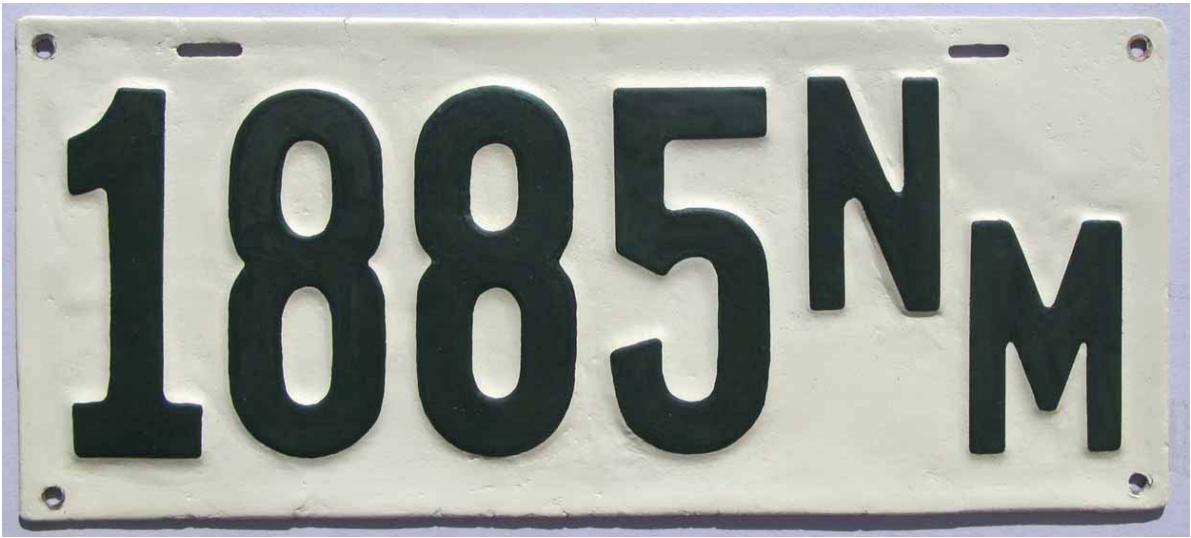
1912/1913 New Mexico license plate